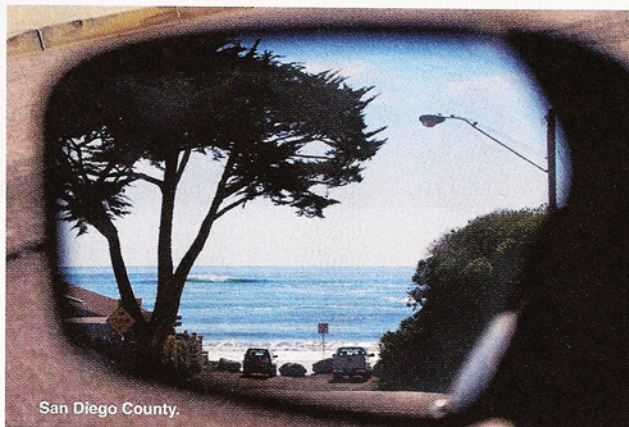
San Diego County.